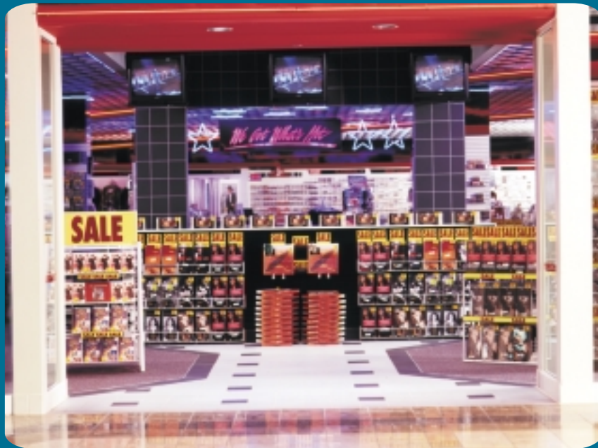
Floor•Max (pedestals in floor)