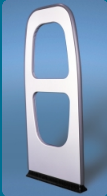
Pro•Max ® I and II